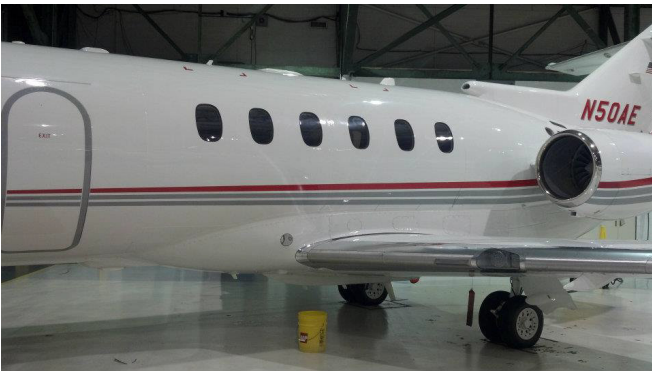
Hawker Beechcraft 900XP

The Dassault-Breguet Mystere Falcon 900 with three Garrett TFE731 SER turbofans has room for 12 passengers. With a wingspan of over 63 feet and a cruising speed of 577mph, it has a 4,233nm range.