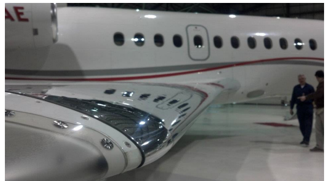
Dassault Falcon 900EX EASY

The French Dassault Falcon 900EX EASy tri-jet, powered by three Honeywell TFE731-60 turbofan engines with 5,000 pounds of thrust each, can reach 41,000 feet in 25 minutes fully-loaded at 45,503 pounds.