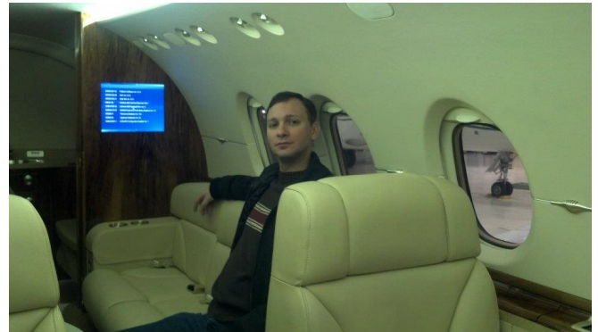
KB2SAI heading out on a DXpedition to Rarotonga

Its EASy all-glass flight deck is based on the Honeywell Primus EPIC military avionics platform with four 14.1 inch flat-panel LCD screens in a "T" configuration for touch screen flight data entry.