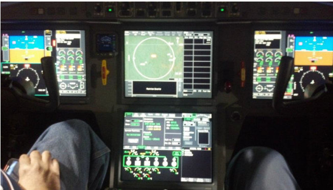
EASy Avionics Platform

Its EASy all-glass flight deck is based on the Honeywell Primus EPIC military avionics platform with four 14.1 inch flat-panel LCD screens in a "T" configuration for touch screen flight data entry.