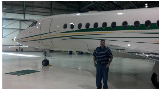
KD8EVR taking delivery of MVARC 1

The 900XP features the Rockwell Collins Pro Line 21 avionics suite consisting of four 8x10 inch LCD screens, integrated with Collins Dual Pro Line 21 communication and navigation radios.